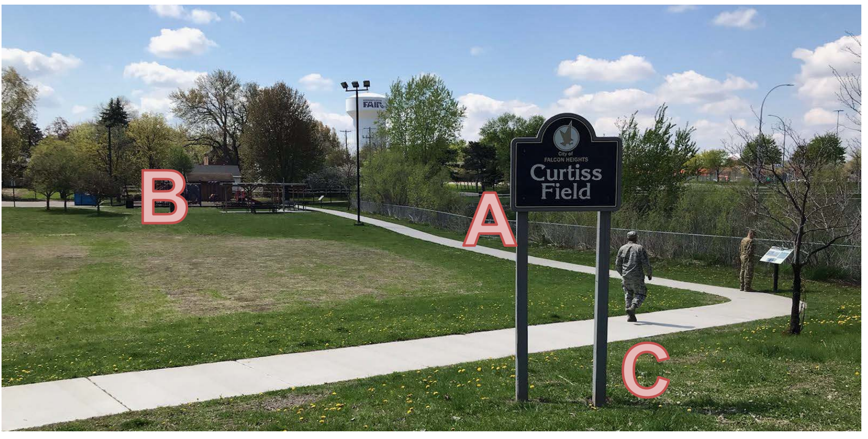
Possible monument locations