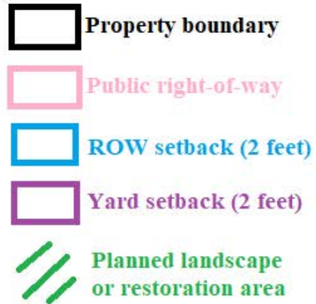
Typical Northhome property