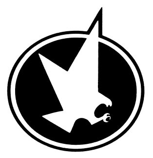
The City That Soars!