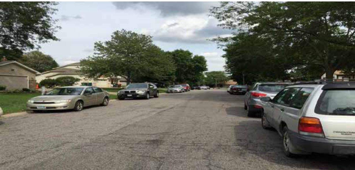
Students parking west to east on Garden Ave on the week day in August