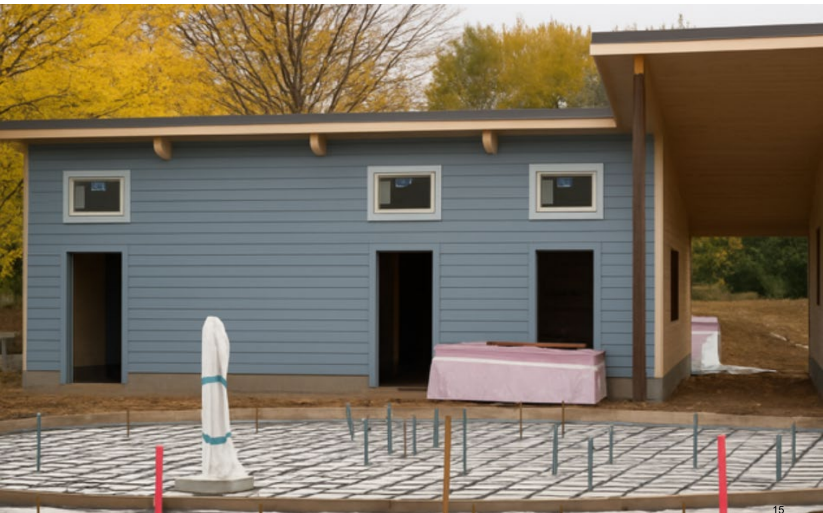
Renderings using ChatGPT