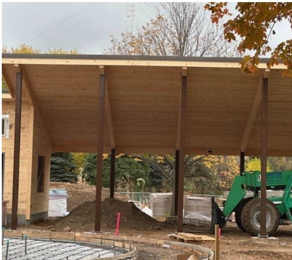
This is the building and picnic pavilion unfinished, as it currently is.