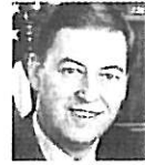
Rod Grams Republican Party