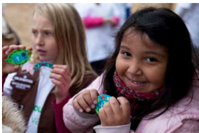
Woodbury Girl Scouts show off their new service event badges.

Girl Scouts 100 Year Anniversary Events: EMWREP helped Girl Scouts of the River Valleys' to plan community clean-ups for clean water to celebrate their 100-Year Anniversary. In the East Metro, Girl Scouts organized clean-ups near Forest Lake, Big Marine Lake, Square Lake, White Bear Lake, Lake Phalen, Beaver Lake, and at Ojibwe Park in Woodbury and Hamlet Park in Cottage Grove. Region-wide, girls marked 6,872 storm drains and distributed 50,000 door hangers. To learn more about the event, go to www.girlscoutsrv.org/about-us/girl-scouts-centennial/centennial-day-of-service .