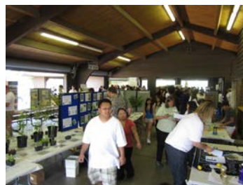
Hundreds of people attended RWMWD's WaterFest at Lake Phalen.

Student Programs: EMWREP participated in the following children's education events: