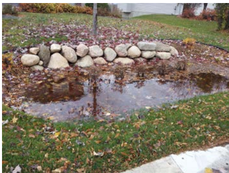
Above: One of the new Colby Lake raingardens shortly after planting.

Targeted neighborhood outreach: Last year, shared education staff conducted targeted outreach in Lake Elmo (VBWD), Stillwater’s Lily Lake neighborhood (MSCWMO), and Woodbury’s Powers and Colby Lake neighborhoods (SWWD). Outreach activities included mailings, open house events and door-knocking. As a result, 50 new stormwater retrofit practices will be installed in these four neighborhoods: