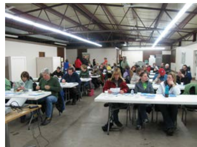
Above: Horse owners learned about protecting water resources.

Buckthorn Workshop: Held in Afton on April 5, this workshop provided residents with information about controlling buckthorn, replanting with native plants, and controlling runoff and erosion on wooded properties.