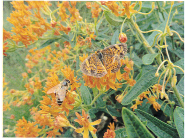
Pearl Crescent & Honey Bee on Butterfly Weed