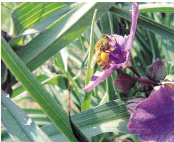
Golden-orange pollen basket on Honey bee