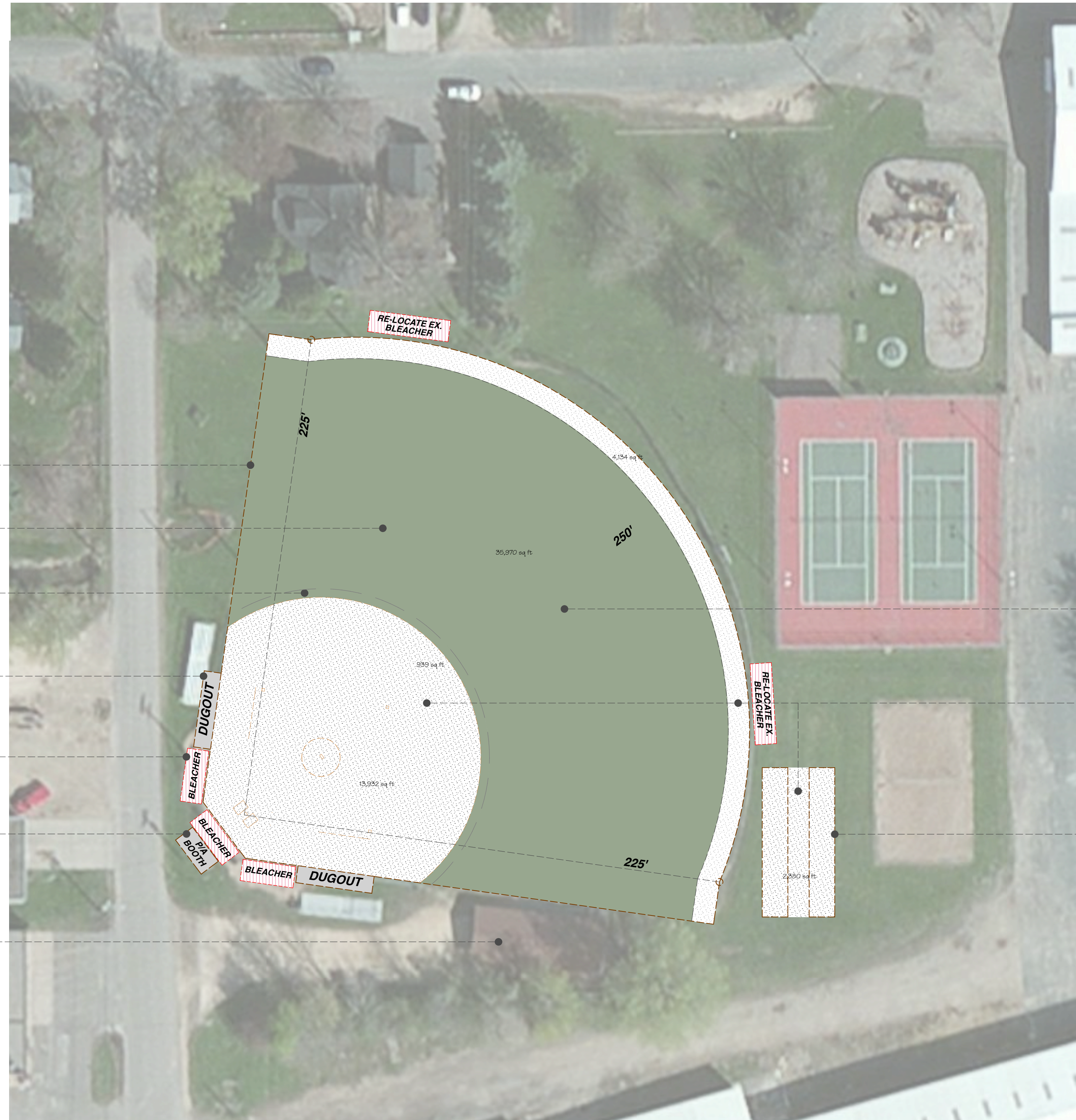
CONCEPTUAL SITE PLAN 1" = 30'