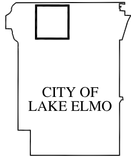
FIGURE NO. 1