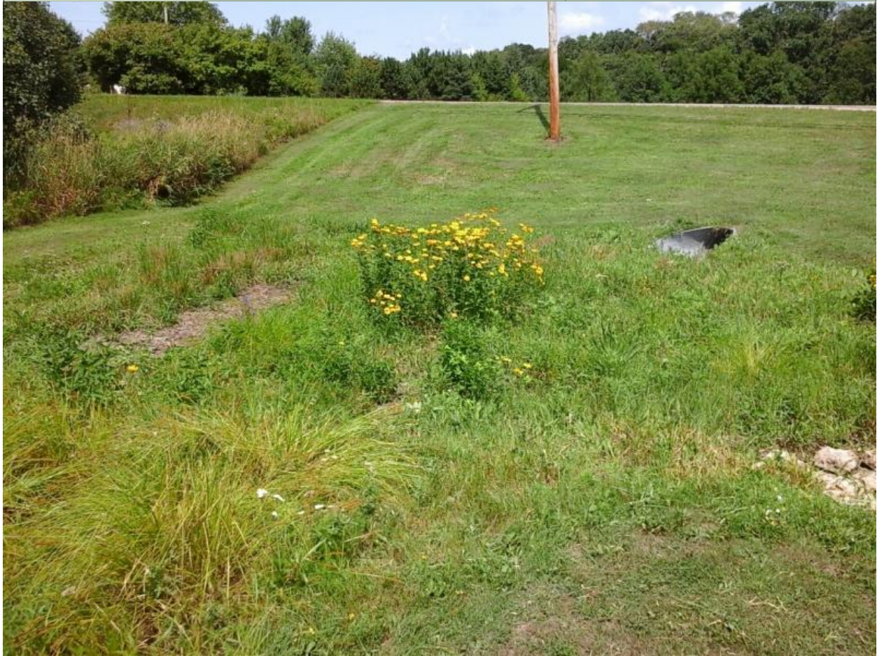
Tablyn Park Entrance Raingarden: second basin

651-330-8220 [PHONE] 651-330-7747 [FAX] WWW.MNWCD.ORG