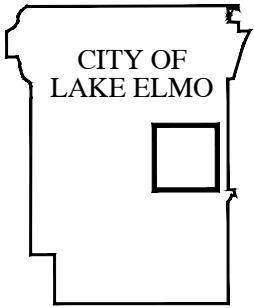
FIGURE NO. 1