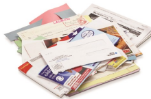
Office Paper & Mail