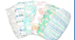
Diapers & Pet Waste