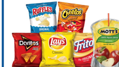
Chip Bags & Juice Pouches