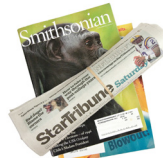
Newspaper & Magazines