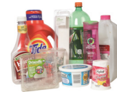
Plastic Bottles & Containers (#1, 2, 5)