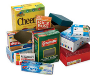
Food & Beverage Boxes