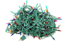
Tanglers (hoses, extension cords, holiday lights, etc.)