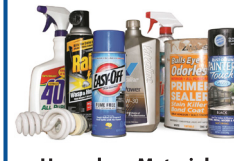
Hazardous Materials (sharps, motor oil, propane, etc.)