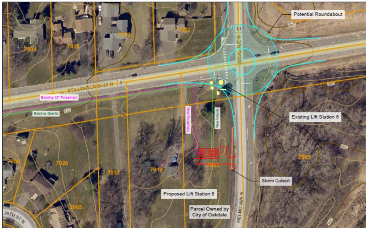
Exhibit A - Lift Station 6 Site Plan