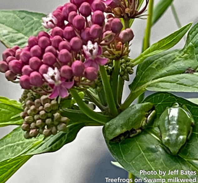
Treefrogs on Swamp milkweed