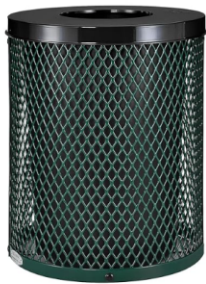
Roll over image to zoom in