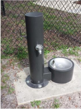
Deluxe Dog Watering Station