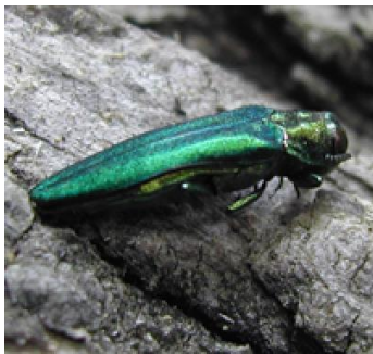
Emerald Ash Borer

https://www.dnr.state.mn.us/.../terrestria.../eab/index.html