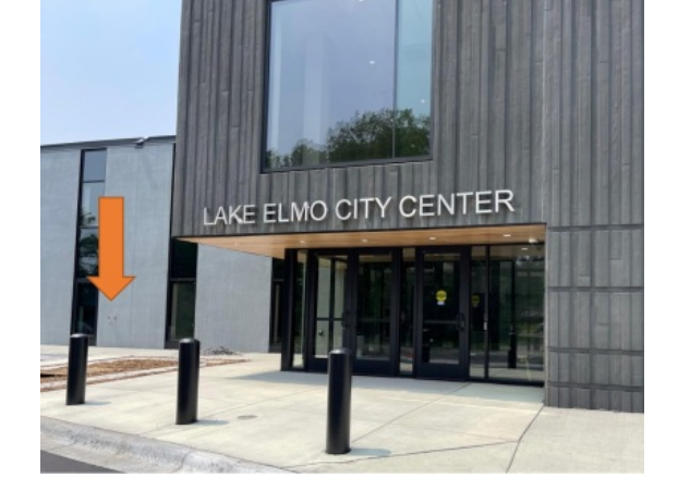
Utility payments, permit applications and other documents may be dropped in the box during or after office hours.