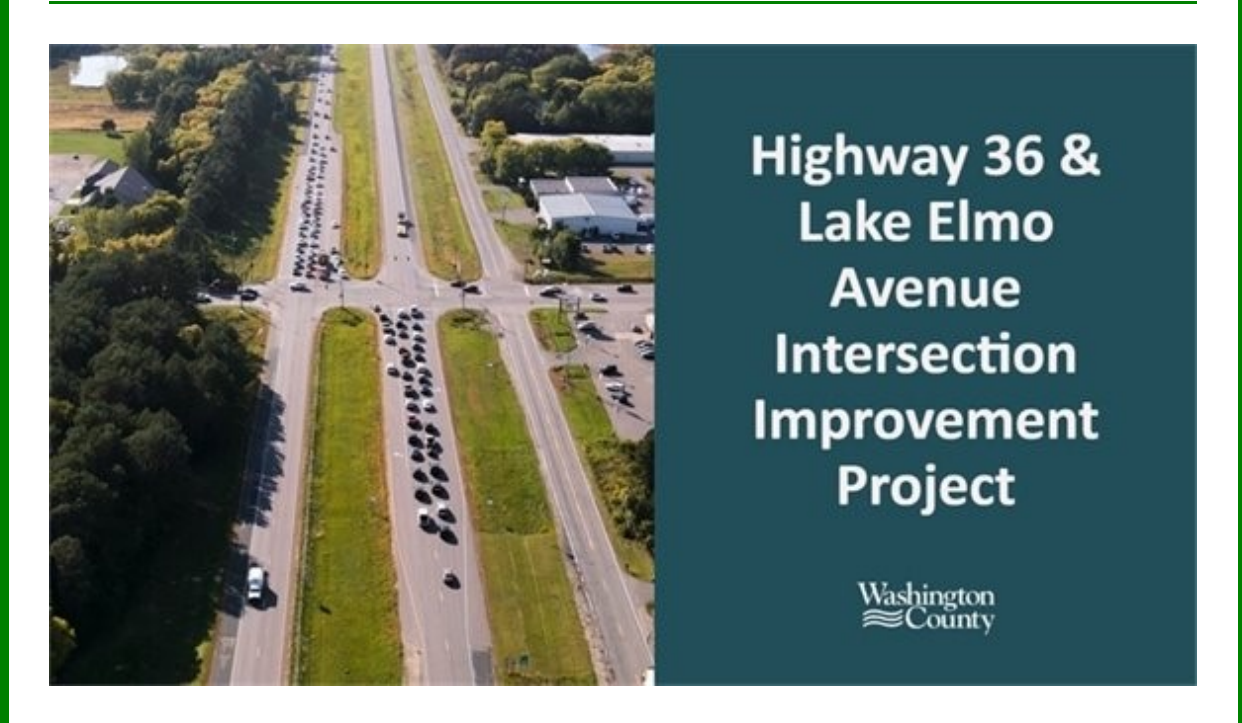
Highway 36 & Lake Elmo Avenue Improvement Project Online Engagement is now live!

Monday - Friday: 8 a.m. - 4:30 p.m. Saturday, March 2: 8 a.m. - 3 p.m. Monday, March 4: 8 a.m. - 5 p.m.