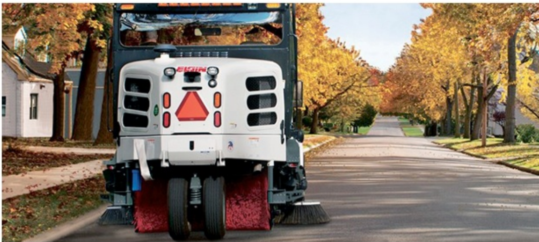
Lake Elmo Public Works

Thank you for your cooperation and stay safe!!