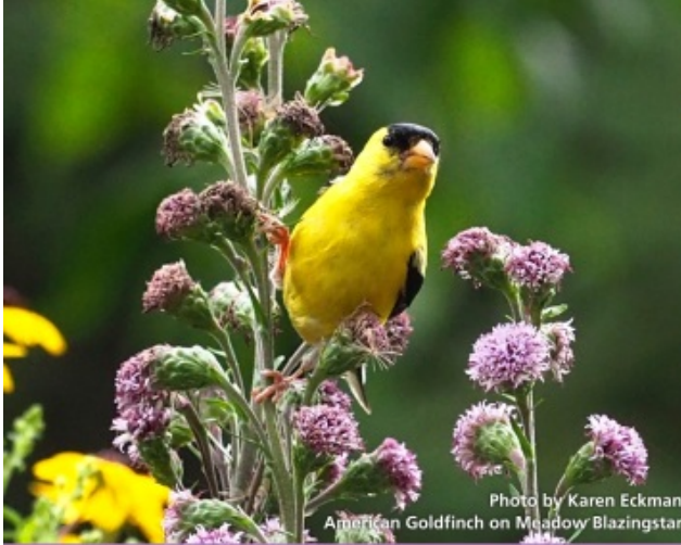
American Goldfinch on Meadow Blazingstar