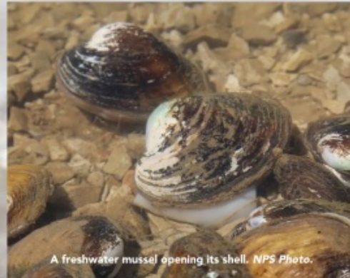
A freshwater mussel opening its shell.