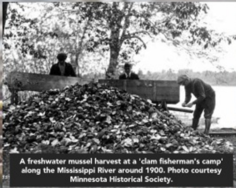
A freshwater mussel harvest at a 'clam fisherman's camp' along the Mississippi River around 1900.

In this interactive instruction, you will learn their simple structure, how they spread their glochidia, and how they clean the water working as "kidneys of the river." Discover how Zebra mussels are different, how mussels helped to grow several Minnesota industries, and the modern day threats to their survival.