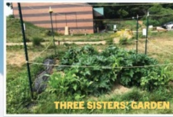
THREE SISTERS GARDEN