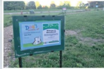
STORY STROLL HIKE LOOP