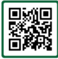
Where Do I Vote?