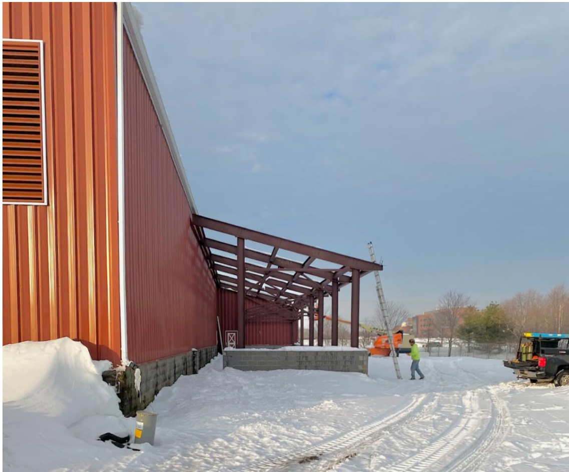
The addition to the public works building on Ideal Avenue is taking shape after delays in delivery of steel for several weeks.