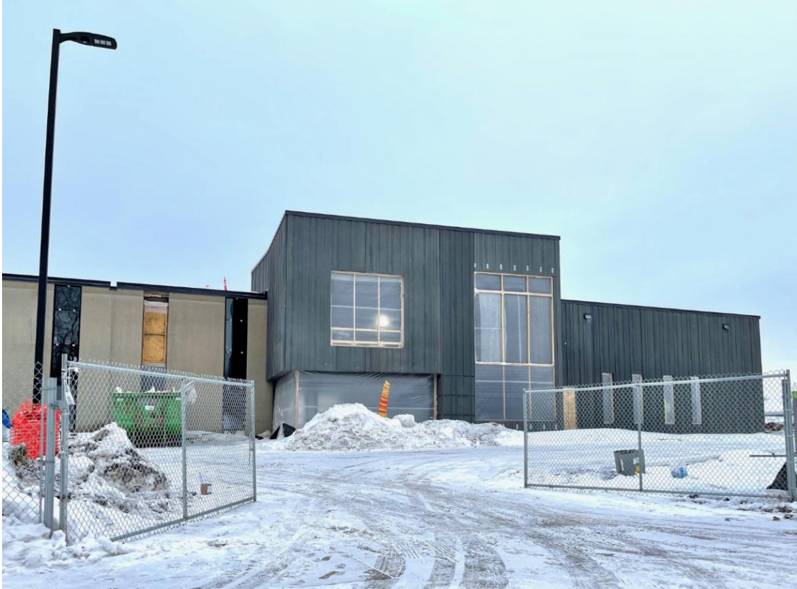
The new front entrance of the City Hall building is progressing and windows will hopefully be installed soon.