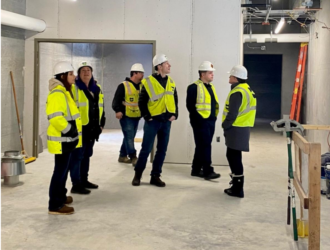
Staff members were able to tour the interior spaces today to get a sneak peek at their future work areas.