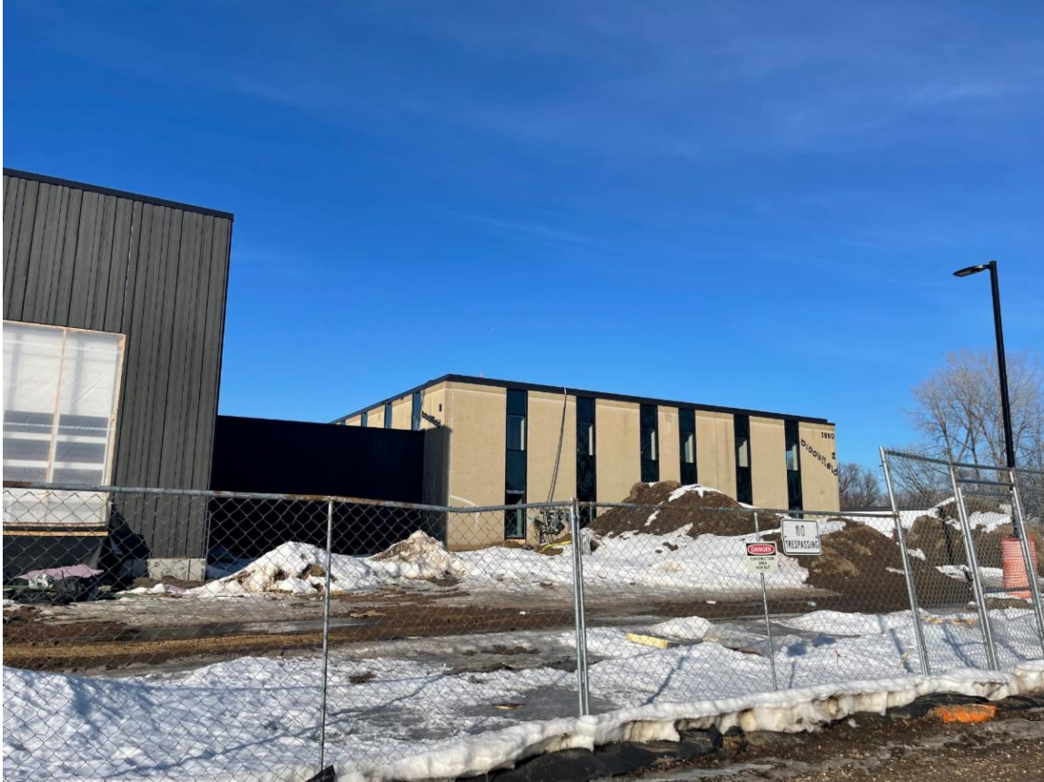
Trim was installed around the new windows on the south side of the building, giving it a sleek look. In the spring this part of the building will get a fresh coat of paint to match the new additions.