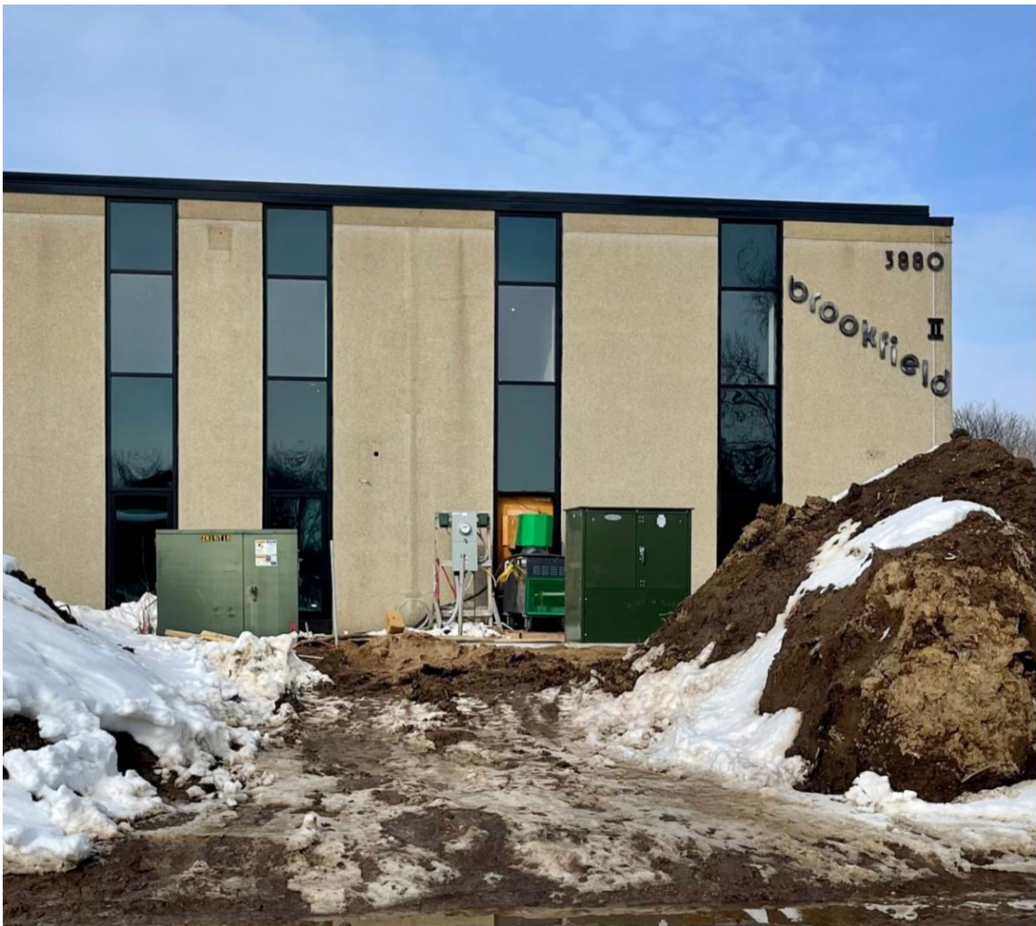
Preparations were made this week for the electric transformer that should arrive next week.