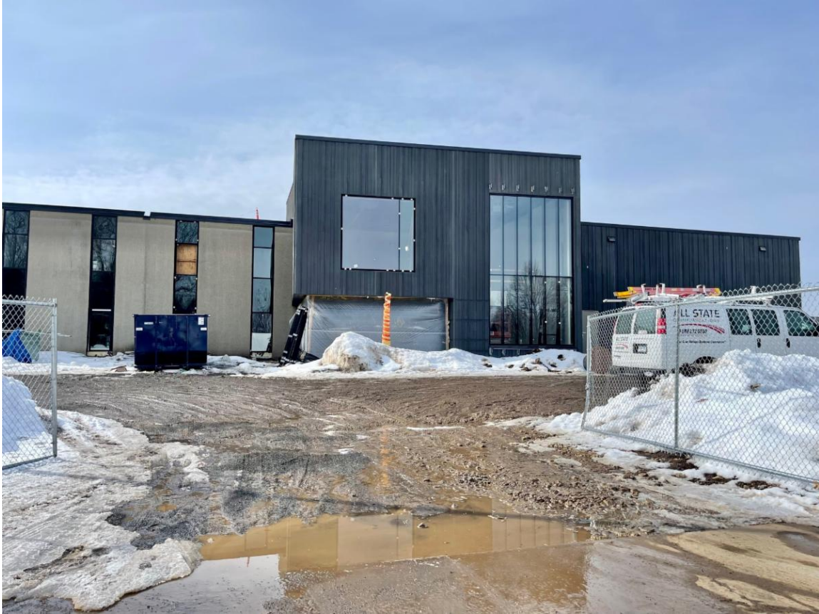
It's a mess outside, but inside the finishing touches are beginning with carpet installation on the upper floor this week.