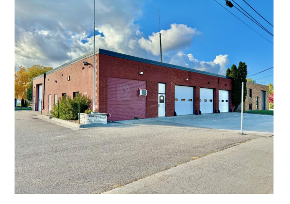
Precinct 1 - Fire Station 3510 Laverne Avenue North