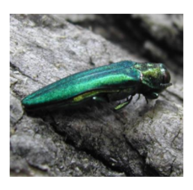
Emerald Ash Borer