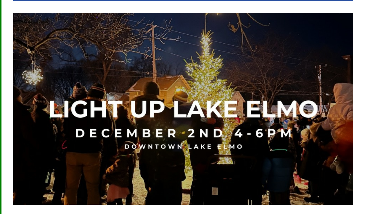
Santa and activities provided by downtown businesses & residents