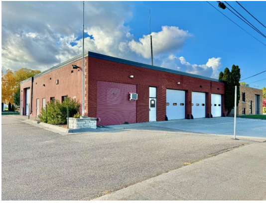
Precinct 1 - Fire Station 3510 Laverne Avenue North