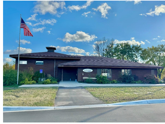
Precinct 2 - Old City Hall Building 3800 Laverne Avenue North