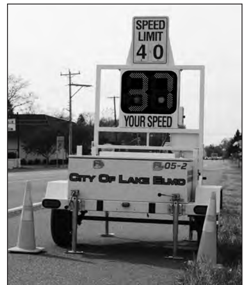
Last year's "zero tolerance" traffic enforcement policy has had a positive impact on speed violations.

One final public safety reminder is that all dogs need to be licensed through Lake Elmo City Hall. Licenses are valid for one calendar year; 2014 dog licenses will be available in November. To report a dog-at-large or any other safety concern, please call the Washington County dispatch at 651-439-9381.