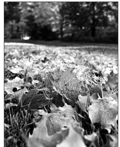
Dispose of leaves properly this fall to protect local lakes and rivers.

Left in the street, leaves can clog storm drains and cause your street to flood. The leaves also contribute