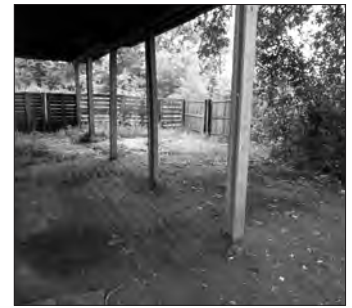
Pictured at left, a Lake Elmo property prior to the adoption of the International Property Maintenance Code. Pictured above, a cleaner view of the same property, after an administrative citation was issued. The entire process took approximately three weeks.

non-compliant have been cleaned up. This includes the property at 9447 Stillwater Boulevard that has been reported for its rundown state numerous times since 2009. Over the course of one month, after the adoption of the new maintenance code, enough trash to fill 14 30-foot dumpsters has been removed from the site. Currently there are 14 active code enforcement cases in the City.