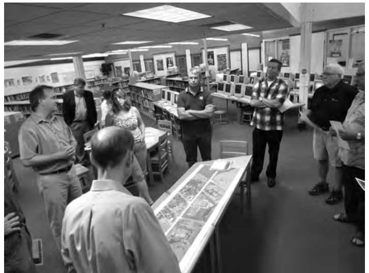
MnDot hosted an open house was held on Wednesday, August 21st, at Lake Elmo Elementary School to discuss upcoming plans for the TH-5 improvement project.

Given the opportunity to restripe the roadway, MnDOT has been working with the City of Lake Elmo to place the new pavement markings in a manner that converts Highway 5 to a 3-lane roadway through the Downtown area, from CSAH 17 (north leg) to 39th Street North. A