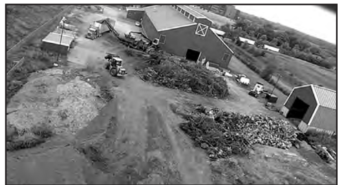
In late August, storm debris was ground into chips at both county and city collection sites. Pictured above is a screen shot from a stop motion video of the chipping occurring at the Public Works facility on Ideal Ave.

Between the two sites, it is estimated that more than 6,000 cubic yards were collected and chipped.