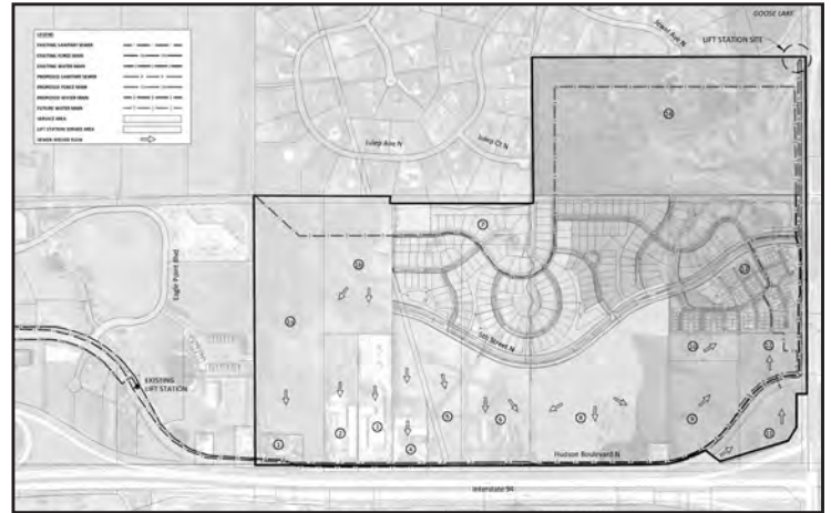
A project location map for the Section 34 water and sewer utility extension improvements.

This Project is the first of a multi-phase plan to bring municipal sewer service to the Village area by constructing a lift station, forcemain and trunk gravity sewer line. The improvements are necessary to convey wastewater from the Village area along Lake Elmo Avenue to the MCES meter station located on Hudson Boulevard. The forcemain pipe, installed along Lake Elmo Avenue and 30th Street, from 10th Street to Reid Park, will not provide sewer service to homes along the way. Forcemain operates under pressure and the pipe is being installed for the sole purpose of conveying the Village wastewater to the MCES connection point. This project will allow for all of the existing properties in the Village Area to be connected to municipal sanitary sewer. In addition, trunk