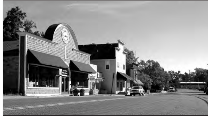
Construction for improvements to downtown Lake Elmo is targeted for construction in 2015.

The first phase of this work is the preliminary engineering; a regional drainage study; and environmental documentation. The objective is to determine a vision for the corridor that will address transportation, pedestrian, and drainage issues. The work will include the evaluation of intersection options, capacity, lane configuration, drainage improvements, and sidewalk options to best accommodate traffic, pedestrian, and business access needs. The study will look at drainage