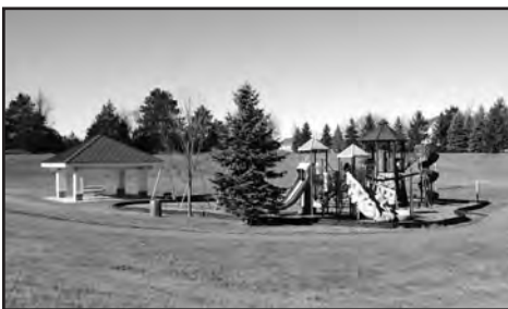
The Lake Elmo Park Commission is deciding how best to improve City parks and plan for growth. Pictured above is Carriage Station Park.

Armed with a recently completed survey and more than $900,000 of funds to allocate toward City parks and trails, the Lake Elmo Park Commission held its first annual retreat on September 28th to begin planning for the future.