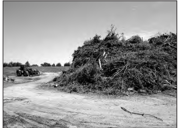
A collection site was created on the northern grounds of the Lake Elmo Park Reserve to temporarily store brush, branches, and stumps that resulted from early summer storm damage.

The City of Lake Elmo and Washington County joined forces this summer to manage extensive tree and property damage that were the result of heavy storms in June and July. City clean-up crews spent more than seven weeks picking up brush from city neighborhoods.