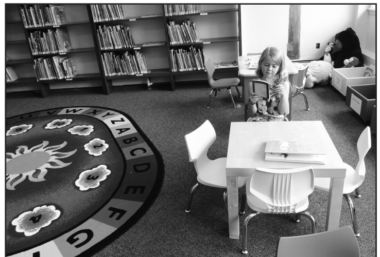
The Lake Elmo Library's new children's room is a popular place for young readers.

Families with infants through pre-school aged children are invited to sign up for the 1,000 Books before Kindergarten