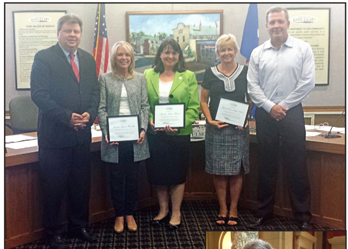
City Administrator Dean Zuleger and Mayor Pearson recently recognized Senator Housley, Senator Kent, Representative Lohmer, and Representative Ward (inset) for support and advocacy that resulted the inclusion of $3.5 million in the state bonding bill for infrastructure to provide clean water in Lake Elmo.

The $3.5 million bond will be available for the City to use in 2015 to build a water main from the intersection of 27th Street and Inwood Avenue down to 10th Street where development is scheduled to take place later in the year with four new subdivisions, the ISD 916 $13 million school project, and a new medical clinic. The project will also contain a booster station that will help equalize the water pressure in the community.