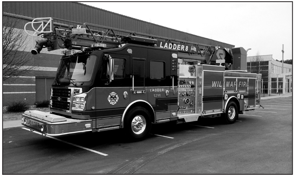
The fire truck pictured above is similar to the new truck that the Lake Elmo Fire Department will be getting in early 2015.

Malmquist added that the ladder height of the current truck is not ad-