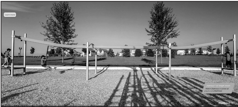
A Zipkrooz, pictured above, is one of the new features that residents will soon be able to enjoy in Pebble Park, as part of the Park Commission's 2014 park improvement plan.

The Lake Elmo Park Commission's primary goal in 2014 is to make improvements to several of the City's parks. The commission conducted audit of the parks last fall to determine which parks could benefit the most from added enhancements.