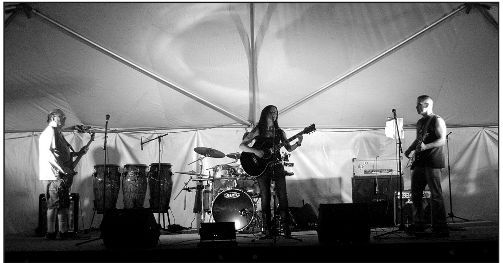
The annual Battle of the Bands Competition is one of several events planned in downtown Lake Elmo this summer.

Head downtown on Friday, July 11 for some live music by the Tumblin' Dice, the Twin Cities number one Rolling Stones tribute band. The street dance will run from 7 pm to 11 pm.