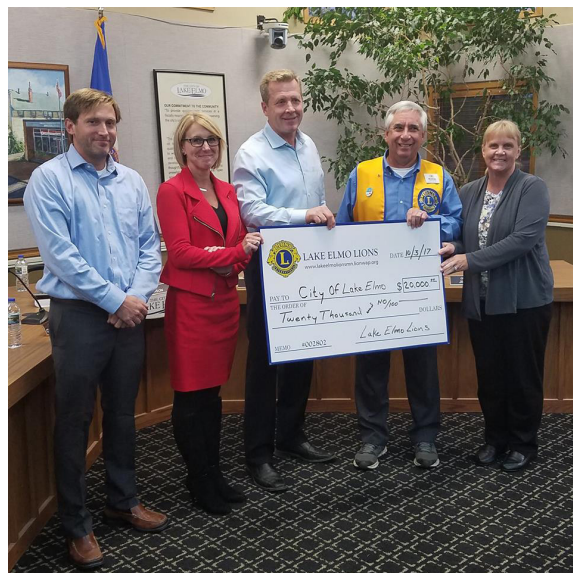
Lake Elmo Lions donated $20,000 towards improvements at Lions Park

In addition to the ballfield improvements, a new parking lot is planned on the northern edge of the park accessible off 36th St. N. This parking lot will house the hockey rink during the winter months. The relocating of the hockey rink is being done to protect the turf and irrigation system that will be installed in the area the rink was previously housed.