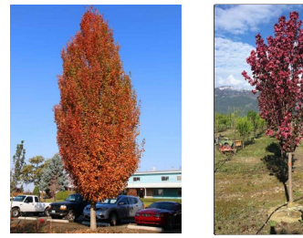
COMMON NAME COMMON NAME. ARMSTRONG FREEMAN GLADIATOR CRABAPPLE MAPLE BOTANICAL NAME: BOTANICAL NAME: MALUS x ADSTRINGENS ACER X FREEMANII 'DURELO' PP20167 'ARMSTRONG