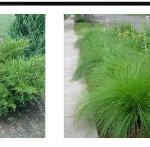
COMMON NAME PRAIRIE DROPSEED BOTANICAL NAME: SPOROBOLUS HETEROLEPIS