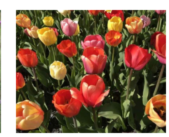
COMMON NAME: ROUGH BLAZING STAR DARWIN HYBRID TULIPS BOTANICAL NAME: BOTANICAL NAME: TULIPA DARWIN HYBRID