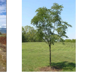
COMMON NAME. COMMON NAME. ESPRESSO KENTUCKY SEA GREEN JUNIPER COFFEE TREE BOTANICAL NAME: BOTANICAL NAME: JUNIPERUS x PFITZERIANA GYMNOCLADUS DIOICUS 'SEA GREEN' 'ESPRESSO-JFS'