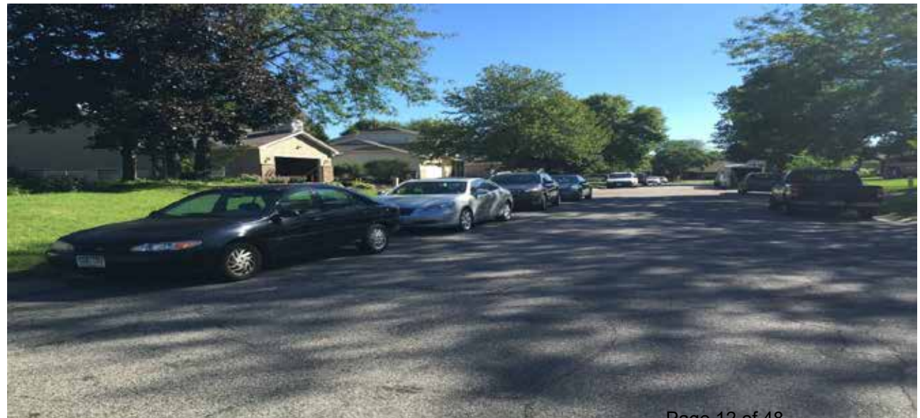
Student parking on Garden Ave west to east in early September