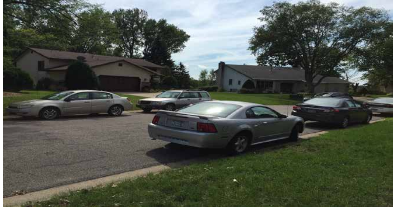
View of 2028 Garden Ave from north to south on the week of August 25th