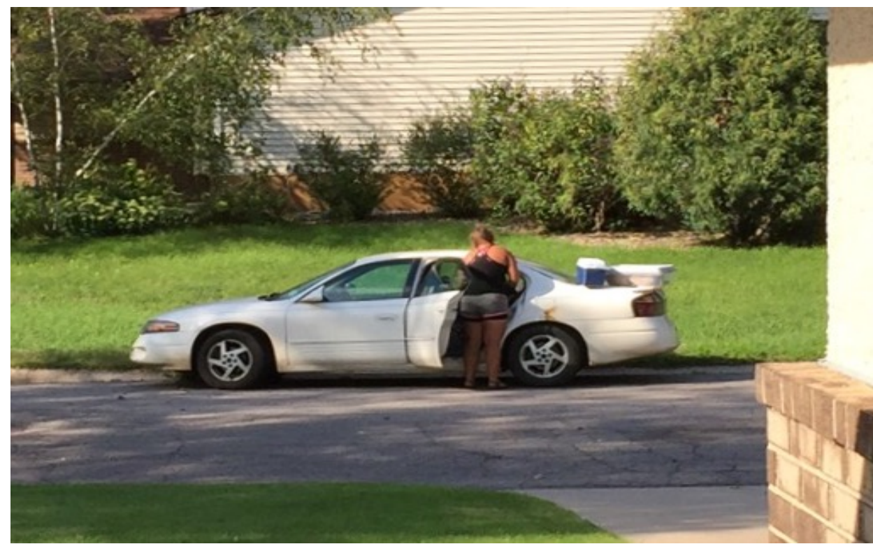
A student who dropped off by a University vehicle (she is changing as she does daily from coveralls) on early September week day.