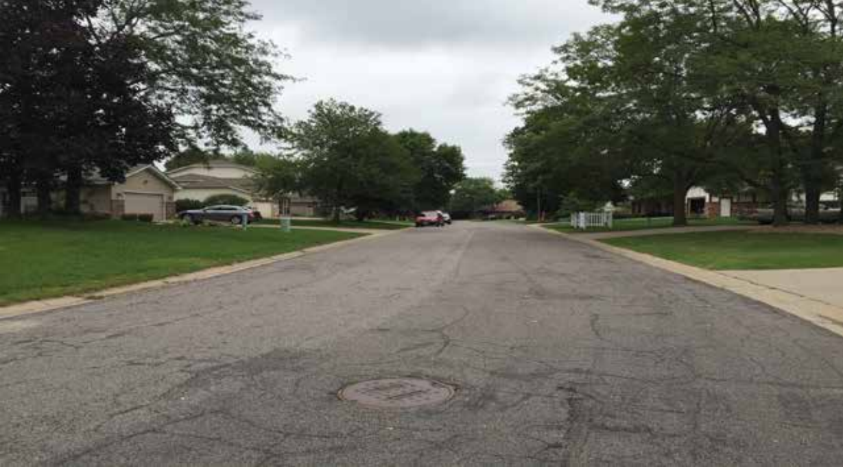
This is what a Saturday looks like west to east on Garden Ave