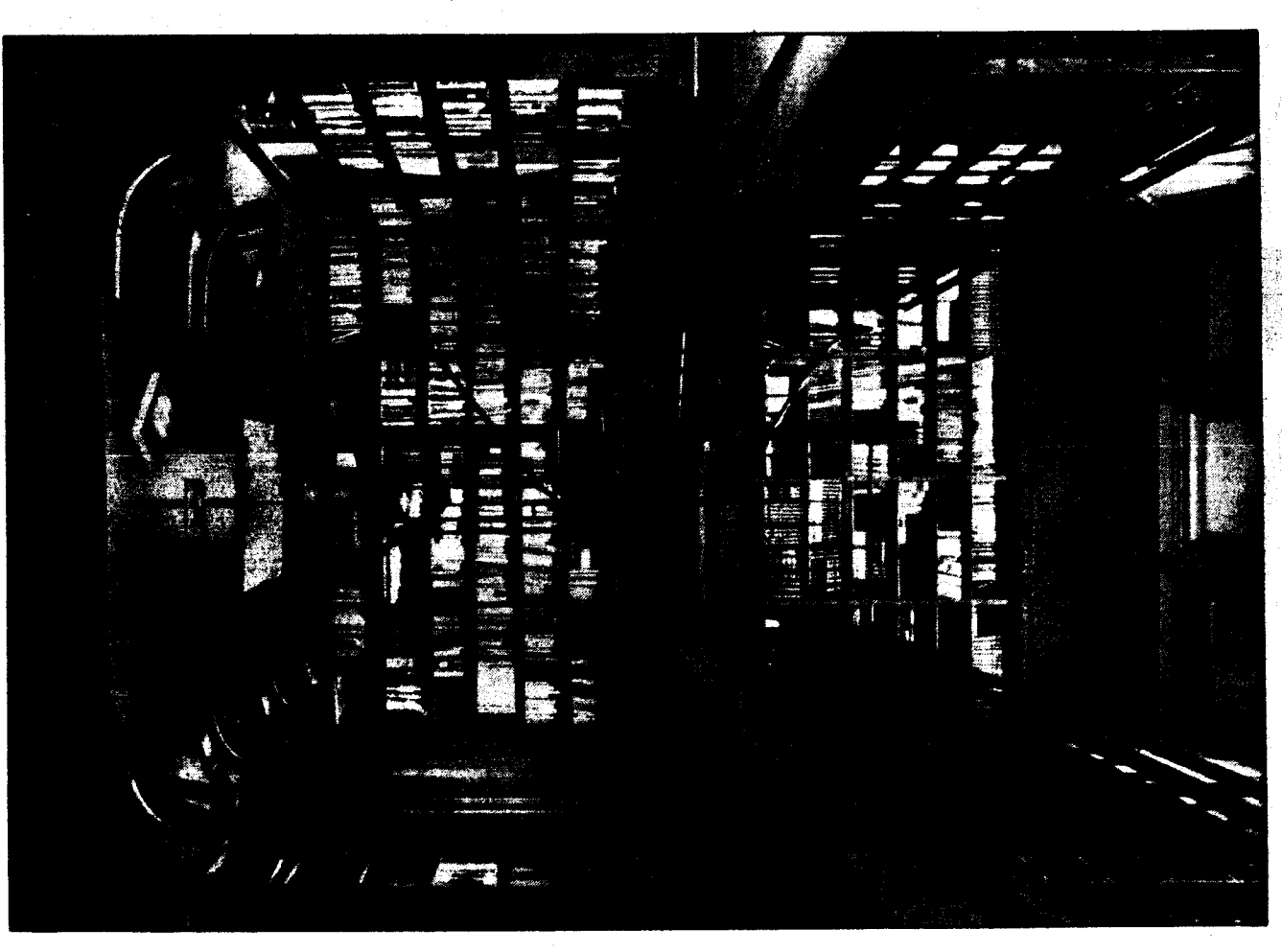
The library is the soul of 1666 Coffman