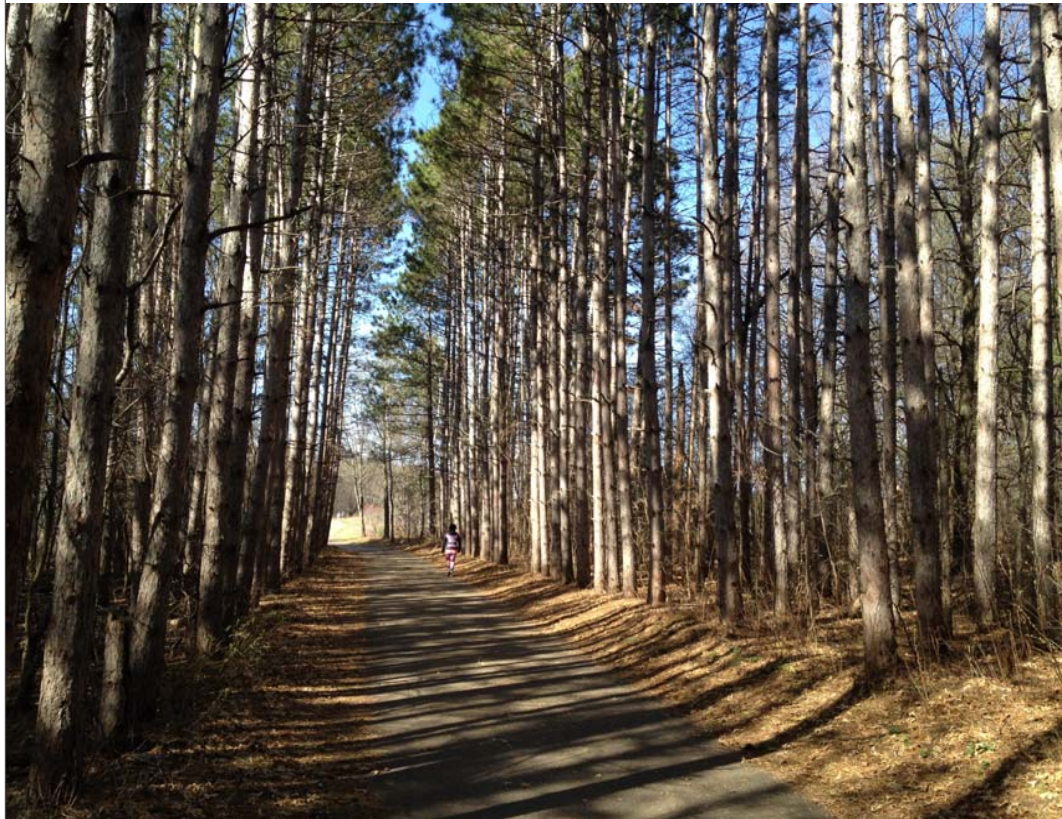
PINE STAND (interior)