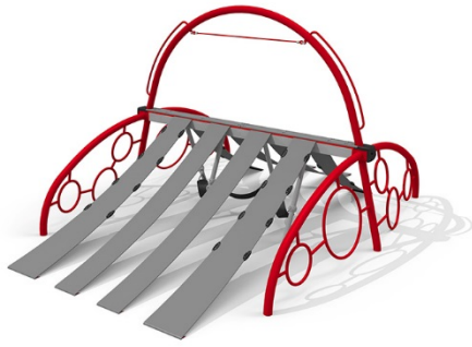
Unity Large Canopy: Inspired by traditional monkey bars. Price: $6,000. Ages 5-12. Dimensions: 25' 4" x 21' 1".