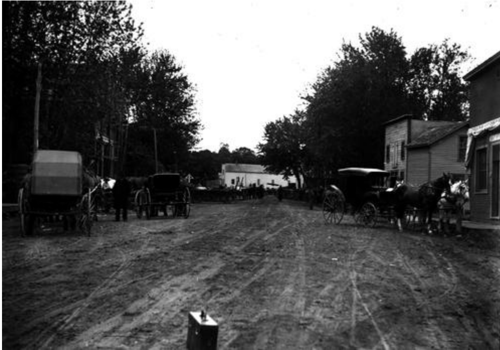
Lake Elmo Main Street in 1906.