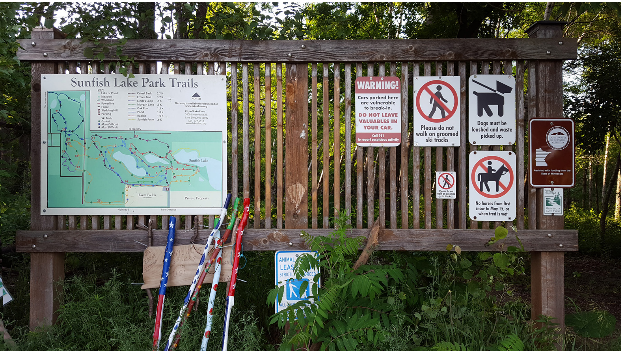
Existing / Current signs at Sunfish today