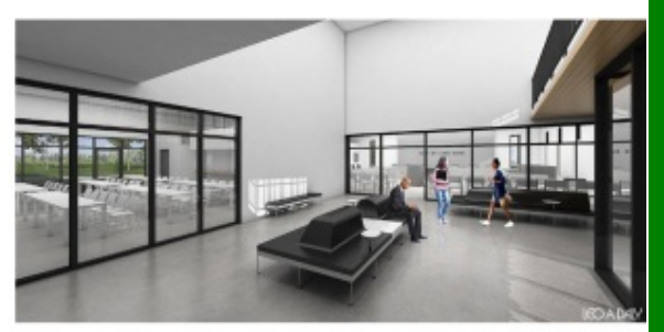
TOTAL ANTICIPATED PROJECT COST: $14,600,000 DESIGN COMPLETION: Late summer 2021 CONSTRUCTION COMPLETION: Fall of 2022

The new Lake Elmo City Hall / Public Safety Facility combines City Hall staff and functions, the entire Fire Department, and a satellite office for the Washington County Sheriff's department. This co-location involves renovating and expanding the City-owned Brookfield Office building to concentrate civic resources into a single structure at the historic core of the city. In addition, the Public Works facility will also be expanded to accommodate City growth and expanded service needs.