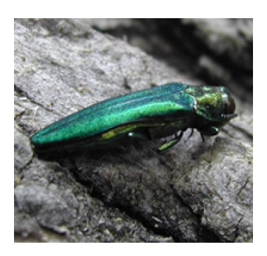
Emerald Ash Borer

minutes to share your feedback with us! The QR code to the left will take you directly to the survey, or you can also access the survey here: Parks Master Plan Survey