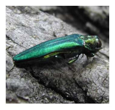
Emerald Ash Borer

https://www.dnr.state.mn.us/.../terrestria.../eab/index.html