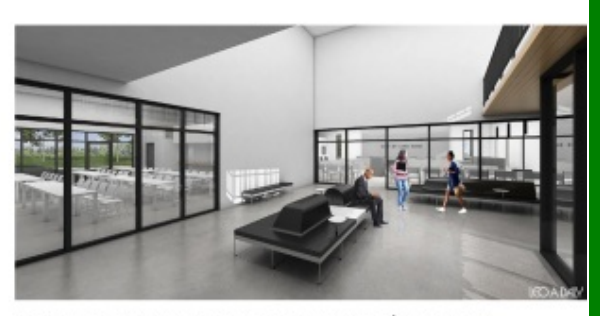
TOTAL ANTICIPATED PROJECT COST: $14,600,000 DESIGN COMPLETION: Late summer 2021 CONSTRUCTION COMPLETION: Fall of 2022

The new Lake Elmo City Hall / Public Safety Facility combines City Hall staff and functions, the entire Fire Department, and a satellite office for the Washington County Sheriff's department. This co-location involves renovating and expanding the City-owned Brookfield Office building to concentrate civic resources into a single structure at the historic core of the city. In addition, the Public Works facility will also be expanded to accommodate City growth and expanded service needs.