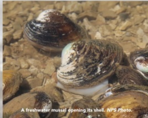
A freshwater mussel opening its shell.