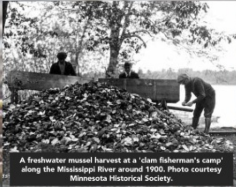
A freshwater mussel harvest at a 'clam fisherman's camp' along the Mississippi River around 1900.

In this interactive instruction, you will learn their simple structure, how they spread their glochidia, and how they clean the water working as "kidneys of the river." Discover how Zebra mussels are different, how mussels helped to grow several Minnesota industries, and the modern day threats to their survival.