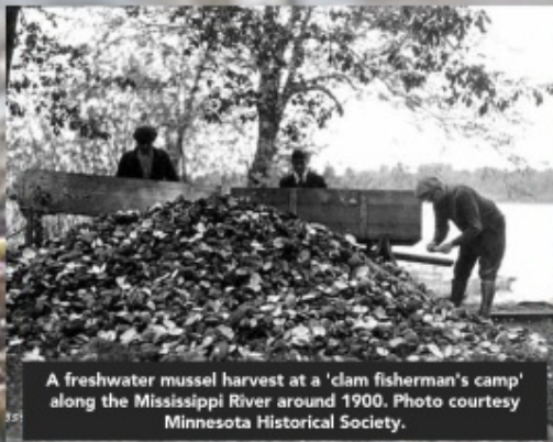
A freshwater mussel harvest at a 'clam fisherman's camp' along the Mississippi River around 1900.

In this interactive instruction, you will learn their simple structure, how they spread their glochidia, and how they clean the water working as "kidneys of the river." Discover how Zebra mussels are different, how mussels helped to grow several Minnesota industries, and the modern day threats to their survival. The MN DNR reports that 28 of our 51 native mussel species are listed as endangered, threatened, or of special concern.