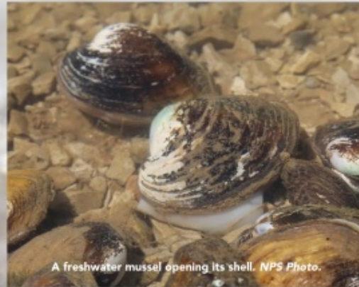
A freshwater mussel opening its shell.