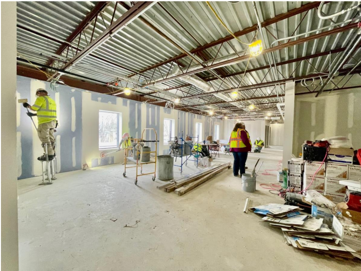
Drywall installation is in full swing throughout the building. This area is the upper level office area that will be home to our finance and administration staff.