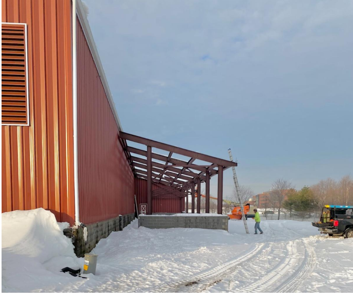
The addition to the public works building on Ideal Avenue is making progress after delays in delivery of steel for several weeks.