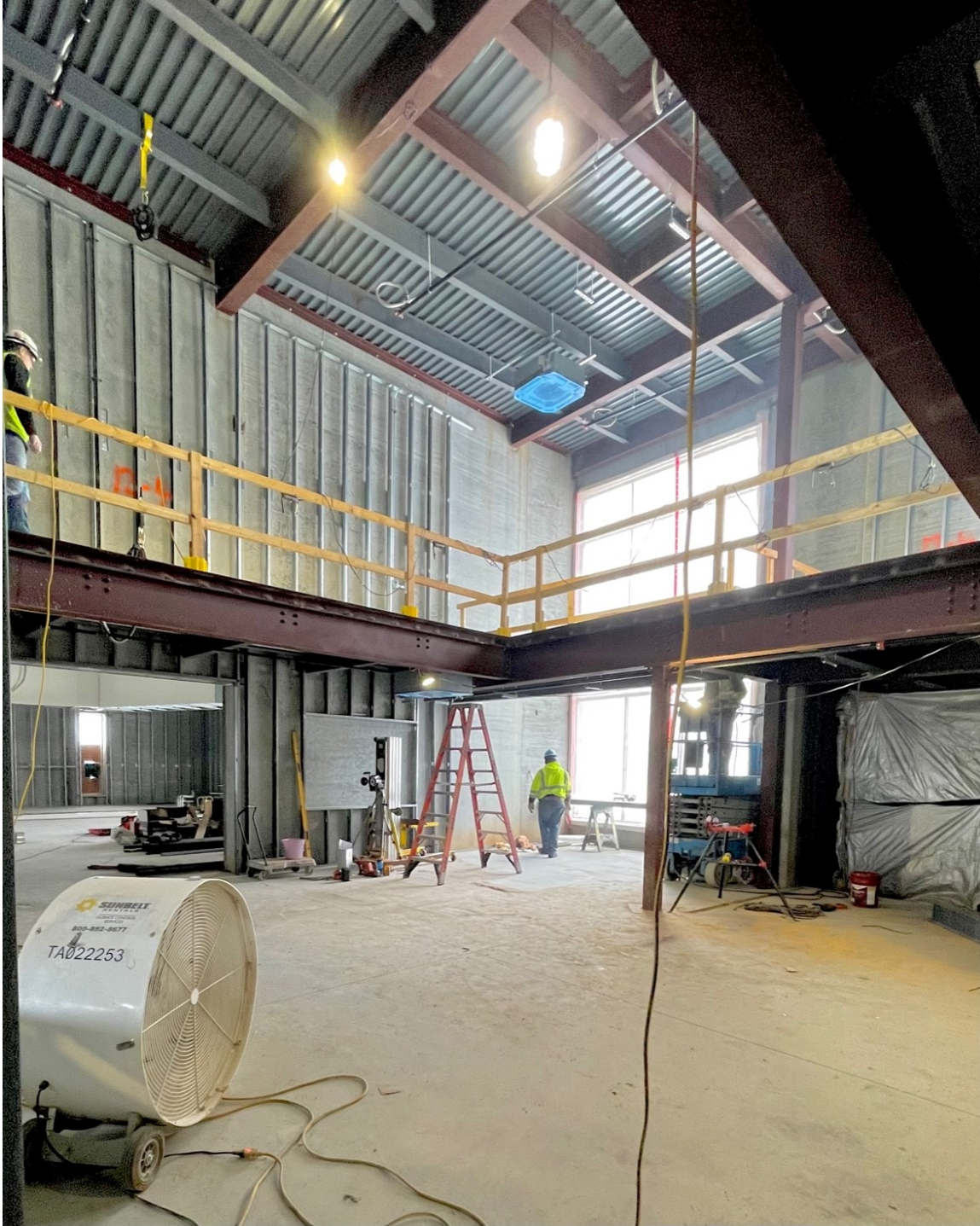
The main entry atrium is starting to take shape! This area will connect the City Council Chambers and Community Room areas to the service counters and office area.