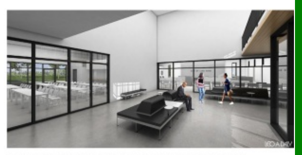
TOTAL ANTICIPATED PROJECT COST: $14,600,000 DESIGN COMPLETION: Late summer 2021 CONSTRUCTION COMPLETION: Fall of 2022

The new Lake Elmo City Hall / Public Safety Facility combines City Hall staff and functions, the entire Fire Department, and a satellite office for the Washington County Sheriff's department. This co-location involves renovating and expanding the City-owned Brookfield Office building to concentrate civic resources into a single structure at the historic core of the city. In addition, the Public Works facility will also be expanded to accommodate City growth and expanded service needs.