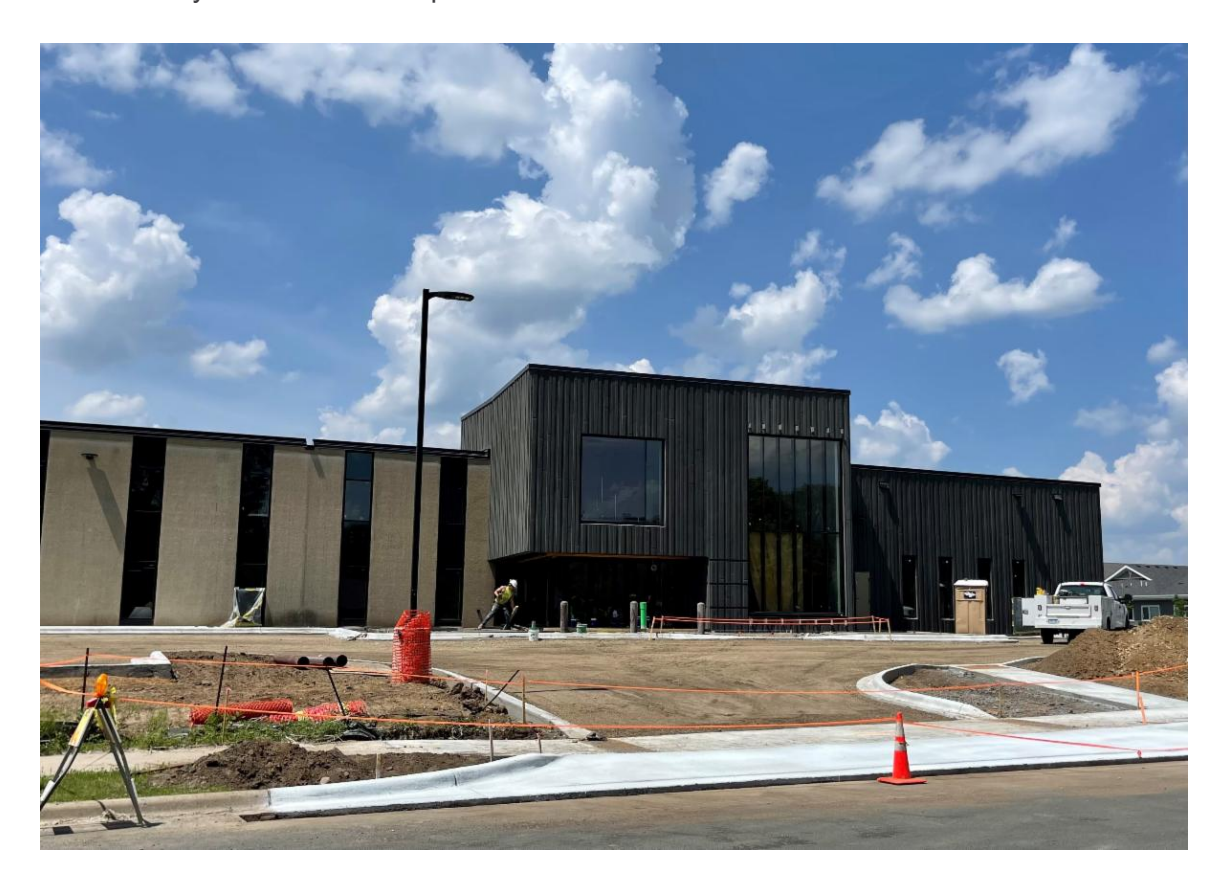
Additional information is available on the City's <u>City Center</u>

Exciting changes this week at the City Center project! Parking lot areas were prepped for paving next week and concrete sidewalks were poured. The exterior of the old building will be painted next week to match the new additions if weather allows. Furniture arrives next week so stay tuned for interior photos!