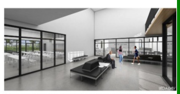
TOTAL ANTICIPATED PROJECT COST: $14,600,000 DESIGN COMPLETION: Late summer 2021 CONSTRUCTION COMPLETION: Fall of 2022

The new Lake Elmo City Hall / Public Safety Facility combines City Hall staff and functions, the entire Fire Department, and a satellite office for the Washington County Sheriff's department. This co-location involves renovating and expanding the City-owned Brookfield Office building to concentrate civic resources into a single structure at the historic core of the city. In addition, the Public Works facility will also be expanded to accommodate City growth and expanded service needs.