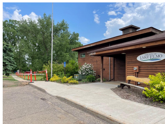
City Hall Temporary Access